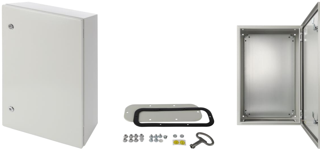
Fig. 1. View of enclosure.