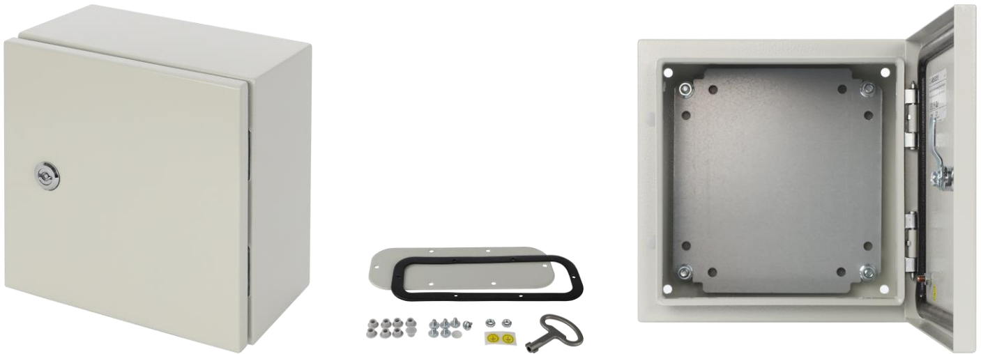
Fig. 1. View of enclosure.