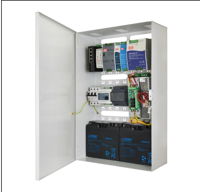
Fig.2 Montaż szyn DIN na plastikowych wspornikach – 20mm (standard equipment)